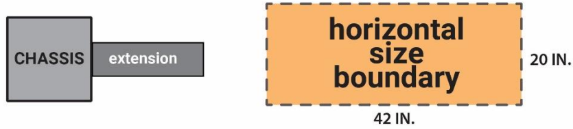
Figure 12-1: Expansion Limits