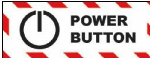
Figure 12-8: example Main Power Switch label