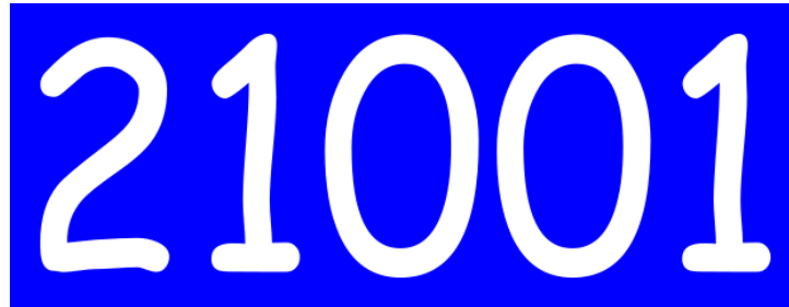
Figure 12-7: Team number orientation examples for team 1355 playing on the blue ALLIANCE