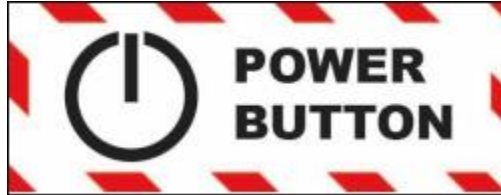
Figure 12-8: example Main Power Switch label